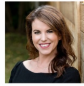
State Representative Ellen Troxclair