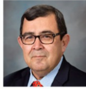
Senator Pete Flores