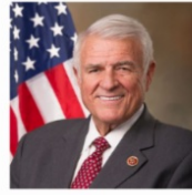
Congressman John Carter