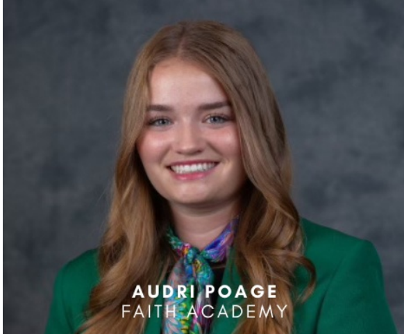
AUDRI POAGE FAITH ACADEMY