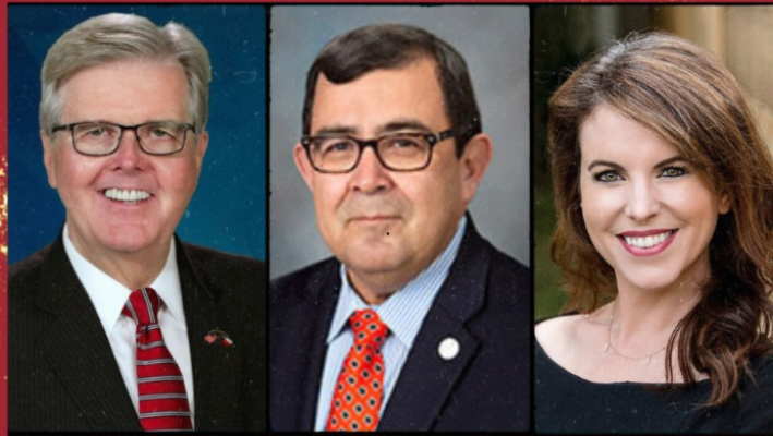
Lt. Governor Dan Patrick