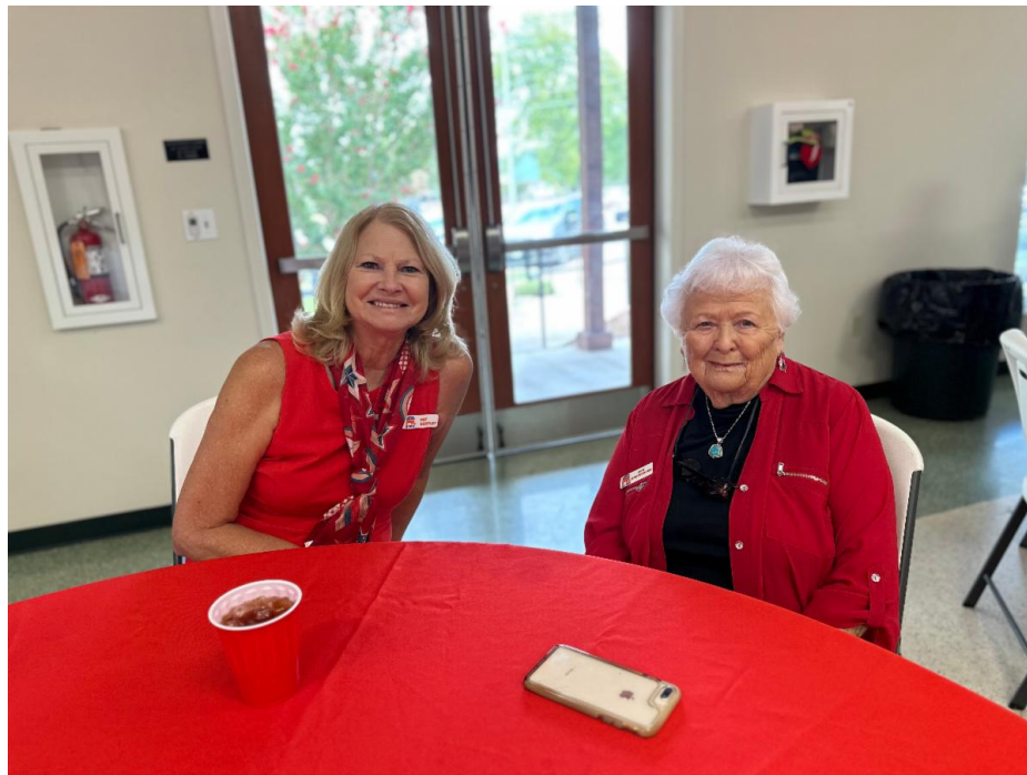
BCRW Block Walkers registering new residents