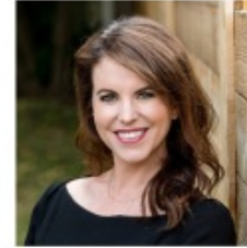
STATE REPRESENTATIVE ELLEN TROXCLAIR