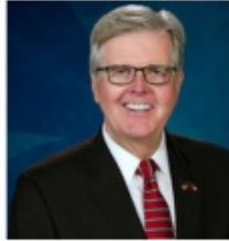
LT. GOVERNOR DAN PATRICK