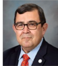
SENATOR PETE FLORES